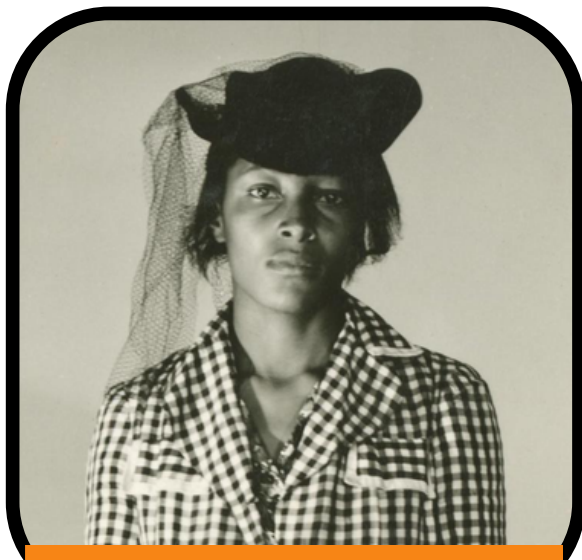
The Rape of Recy Taylor

In 1944, Recy Taylor, a 24-year-old black mother and sharecropper, was gang raped by six white boys in Alabama. Fearless, Recy identified her rapists and fought for justice. Learn about this incredible woman who stood up for herself in the Jim Crow South, paving the way for women's rights everywhere.